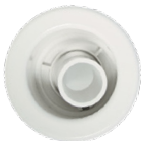
STD SWIM JET

Because there are so many different sizes of hydrotherapy jets, there is no hard and fast rule concerning pump size. In general, large jets (15-20 GPM) require 1/4 Hp per jet. Some jets are so small you can have a 1 Hp pump drive eight to ten of them. At the other extreme, some small swim spa jets require 1 Hp per jet.