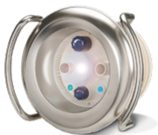
POWER SWIM JET

Manufacturers often use two or more pumps to power individual groups of jets if the total jet area is extremely large. This practice generally saves money for everybody.